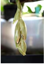
Stan. wardii in bud