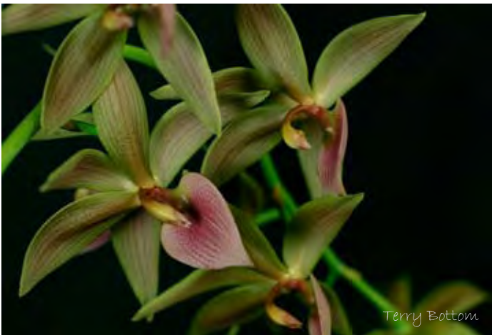
Grower Sue Bottom - February Cycd. Opalina