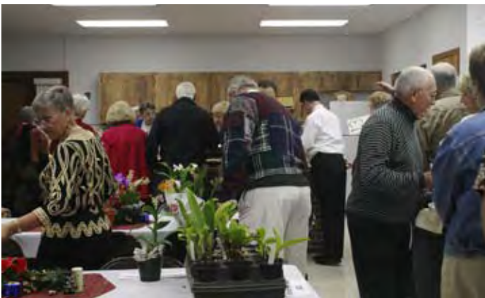
Members queue up for the buffet