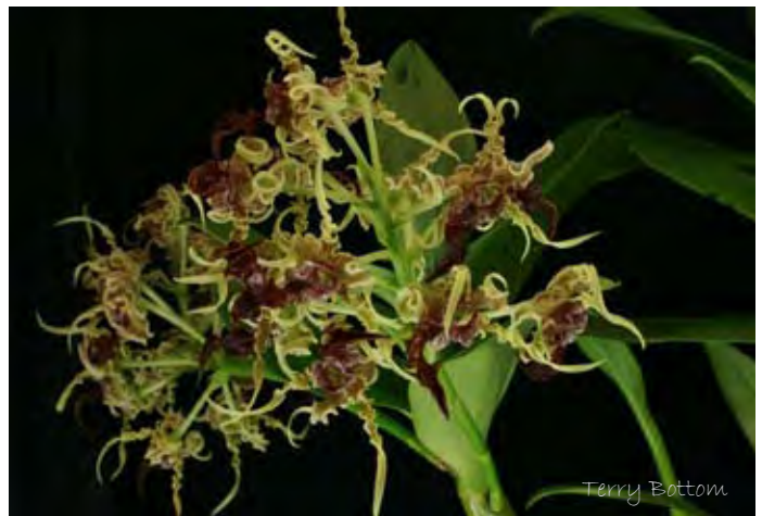
Grower Sue Bottom - May Den. spectabile