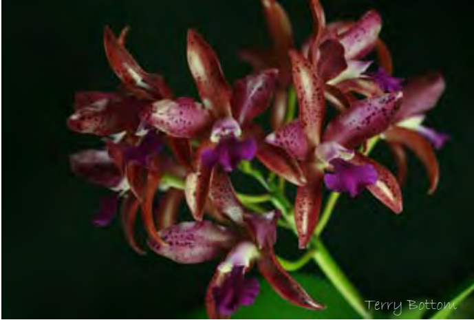
Grower Sue Bottom - January C. Chocolate Drop x C. amethystoglossa