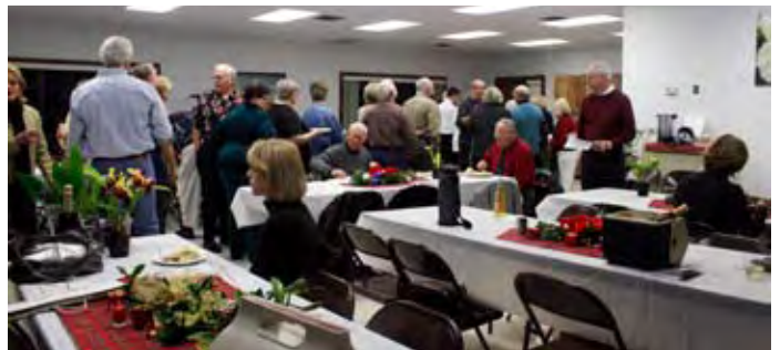
Members socialize while waiting for the buffet