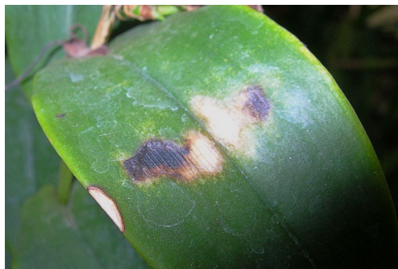
1a and b. Sunburn typically occurs on the high point of the leaf where the sun angle is most direct

Each plant has a maximum light saturation point, the maximum amount of light that it can absorb and convert into chemical energy. If exposed to higher levels of light, it will absorb the energy of the light without being able to process it, so the internal leaf temperature will increase to potentially unsafe levels, possibly resulting in sunburn. For most plants, the light saturation point occurs at about 25 to 50% of full sunlight. When exposed to excess light, leaves must dissipate the surplus absorbed light energy to prevent damage to the photosynthetic apparatus, otherwise known as sunburn.