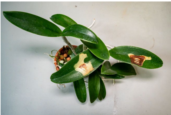
2c. Two large blotchy spots, but not on the highest point of the leaf where you would expect the sunburn to occur. Bleached light tan spots, has brown scarring sunken tissue over bleached areas. In area of worst damage, there is brown showing on the leaf underside.