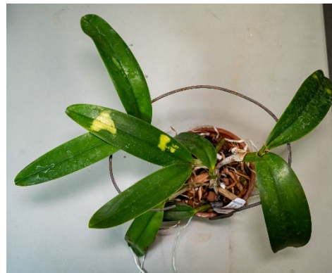
2d. Two splotches of slightly raised light green tissue on upper surface, one would be in right place for sunburn and the second wouldn't be, nothing on leaf undersides.

After a conversation with Dave Off in which he noticed the same thing in the Waldor greenhouses, we decided to send some samples off to Waypoint Analytical for analysis. The Waypoint report stated that there were isolated Colletotrichum species present, the fungus responsible for causing the leaf spotting disease Anthracnose: "In most cases, this disease is considered more aesthetic than life-threatening. Efforts for reducing the spread of disease