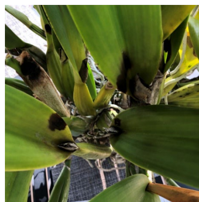
3c. You might think this is rot from water pocketing in the sheath, but there is no sheath and the tissue is green above the leaf axil.