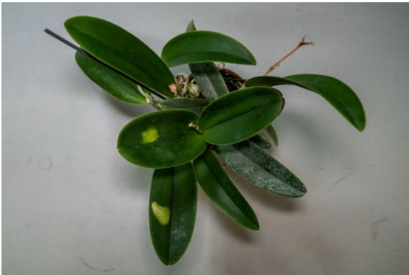
2a. Splotches of slighted raised light green tissue on upper leaf surface, no sporing bodies on either surface, spots almost look like they are bleached as if close to sunburn.

light green to tannish and the tissue becomes slightly sunken from the surrounding leaf. Typically, there are not discoloration or markings on the leaf underside. In advanced stages, the tissue can turn to dark brown in the center of the discolored blotchy patch, and becomes more sunken, with the discoloration apparent on the lower leaf surface. Often found on seedlings, it does not seem to impair growth, and the symptoms do not seem to spread readily to other plants.