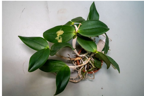
2b. Bleached area of slightly sunken light tan tissue on upper surface of leaf. Visible veins in leaf in bleached area. No markings on leaf underside.