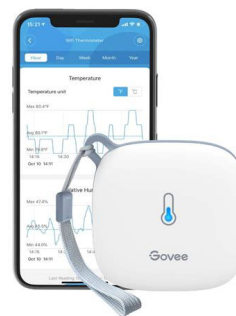
Govee Model H5179 Temperature and Humidity Sensor

Of course, mercury thermometers do not have all the bells and whistles that some of the digital devices offer, like remote monitoring, alarms and phone notifications. I have a box of failed temperature and humidity monitors, but this year discovered one that seems to work really well: a Govee H5179 thermometer/hygrometer combination that measures both temperature and humidity. This is a battery-powered sensor that communicates to your phone via a 2.4 GHz WiFi connection using the Govee Home app, for either Android or Apple devices. You can get the instantaneous readings on your phone using their Widget, as well as view the data from the last hour, day, week, month or year on your phone. You can check the temperature in your growing area whether you are sitting in front of the TV at home or up in the mountains of North Carolina. You can set high and low temperature alarms, so a notification is sent to your phone in the event temperatures are outside of your preset acceptable range. Another nice feature is the low battery warning light, to let you know it's time to switch out the three AAA batteries. I also have